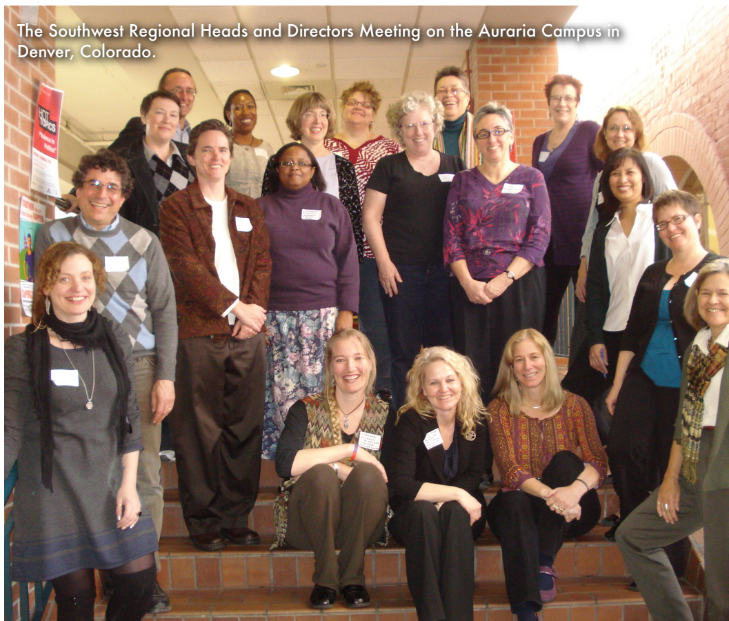
The Southwest Regional Heads and Directors Meeting on the Auraria Campus in Denver, Colorado.