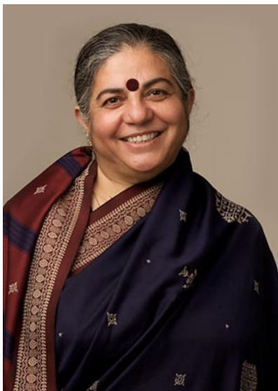
The IWSS recently hosted a public talk by feminist environmental activist Vandana Shiva in Denver.